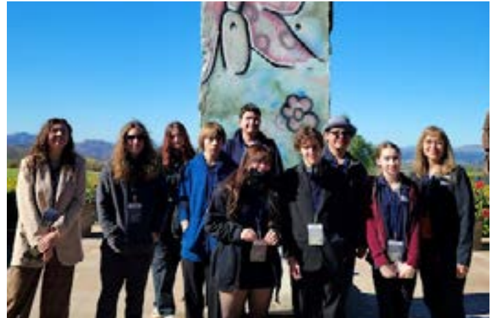
Seeing and also even touching an actual piece of the Berlin Wall is always a highlight of the trip.