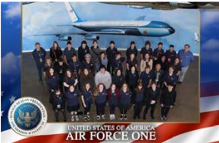
Glacier and Endeavor Leadership students in front of the mural of all Air Force Ones over the years.