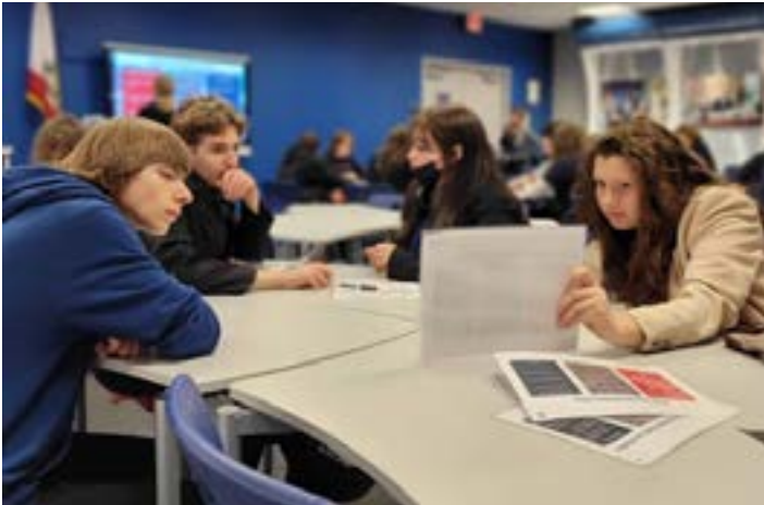
Leadership students practice identifying credible sources before moving to the simulation.