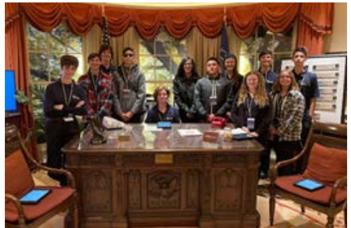
Some students fulfill their simulation roles in an impressive replica of the Oval Office.