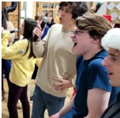
"I did it my way!"