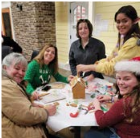
Good job Team 2!