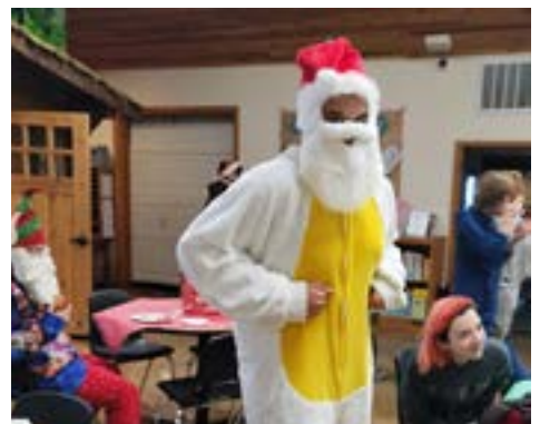
The Santa Chicken even made an appearance!