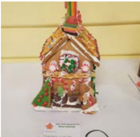
1st place in the Gingerbread House Decorating contest went to Team 2 for this lovely creation.

The End of the Semester/Christmas Party was a HUGE success! Just take a look at a few pictures from the night.