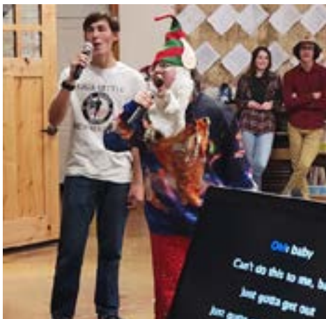
Even Christmas elves get into Bohemian Rhapsody. Who knew?