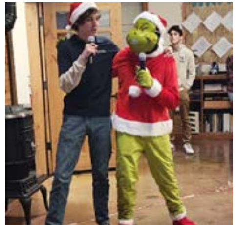
Karaoke was a huge hit and even the Grinch got involved.