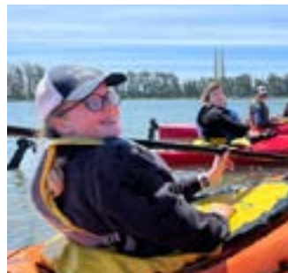
Biology Class Kayaking the Elkhorn Slough in Moss Landing