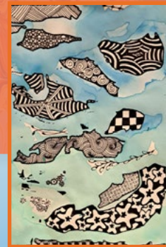
Art 2 example by Olivia Kriehn